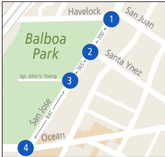
Figure 3: San Jose Ave. crossings to Balboa Park:

To address this feedback, the SFMTA is working to immediately upgrade the three intersections with existing marked crosswalks. As a first step, the SFMTA installed a rapid flashing beacon at the San Jose Avenue/Havelock Street intersection earlier this year. The proposed project would also add intersection daylighting at this intersection as well as adding a rapid flashing beacon at San Juan Avenue, just to the north. The existing crosswalk at Santa Ynez Avenue, which has all-way stop signs, would be upgraded with continental striping as well. The conversion of the center lanes to transit-only would also improve crossings by reducing vehicle speeds and adding predictability to which lanes will have through traffic in them.