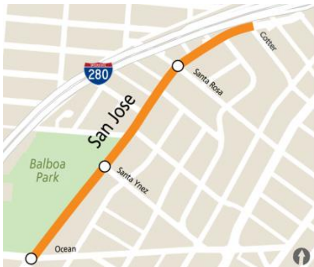
Figure 1: San Jose Avenue segment of the J Church line

San Jose Avenue is a corridor along the J Church line, that serves as the main thoroughfare of the Mission Terrace neighborhood, providing access to local businesses, recreational areas, and public resources, such as Balboa Park and the Balboa Park BART station. The street is on the High Injury Network, the 13% of San Francisco streets that account for 75% of severe and fatal traffic crashes.