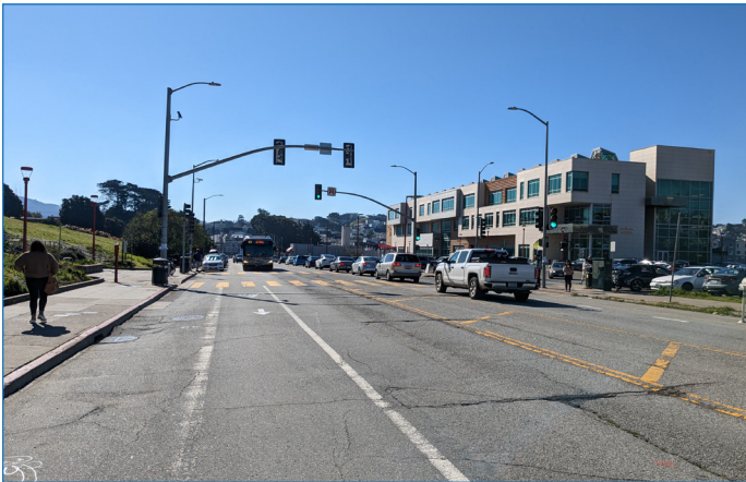
Frida Kahlo Way