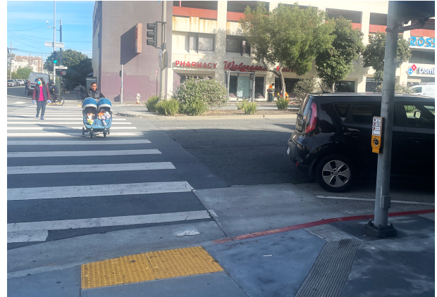
Crossing Geary Boulevard at 17 th Avenue

The SFMTA has been working to improve transit and safety on Geary Boulevard since the completion of the project's environmental phase in 2018. The first phase of work, called the Geary Rapid Project , was completed on schedule in fall 2021 and resulted in significant transit and safety improvements, including up to 18% faster bus travel times, a 37% improvement in transit reliability, and an 81% reduction in excessive speeding by private vehicles.