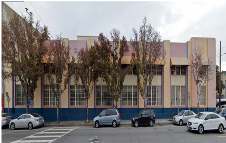
Building Elevation Facing Harrison St.