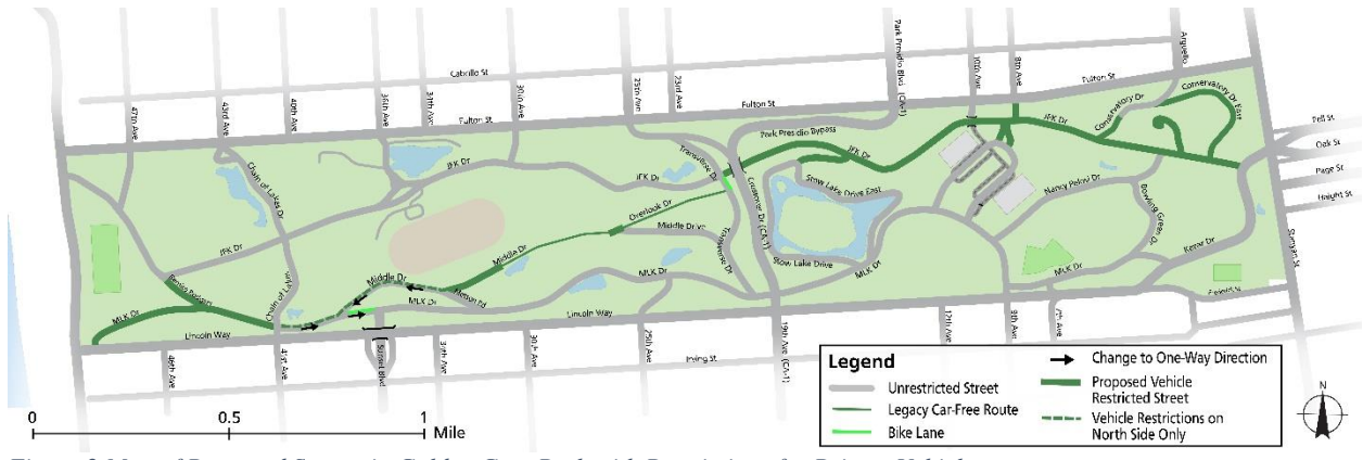
Figure 2 Map of Proposed Streets in Golden Gate Park with Restrictions for Private Vehicles

All of these roadways will continue to be open to bicycles, scooters, emergency vehicles, Paratransit vehicles, park maintenance vehicles, and vehicles permitted to use Golden Gate Park facilities by RPD. Muni vehicles and the Golden Gate Park shuttle will be permitted to use streets on their respective assigned routes. Vehicles accessing the de Young Museum loading dock will be permitted to use 8<sup>th</sup> Avenue and JFK Drive for egress and ingress as needed, in accordance with the adopted policy.