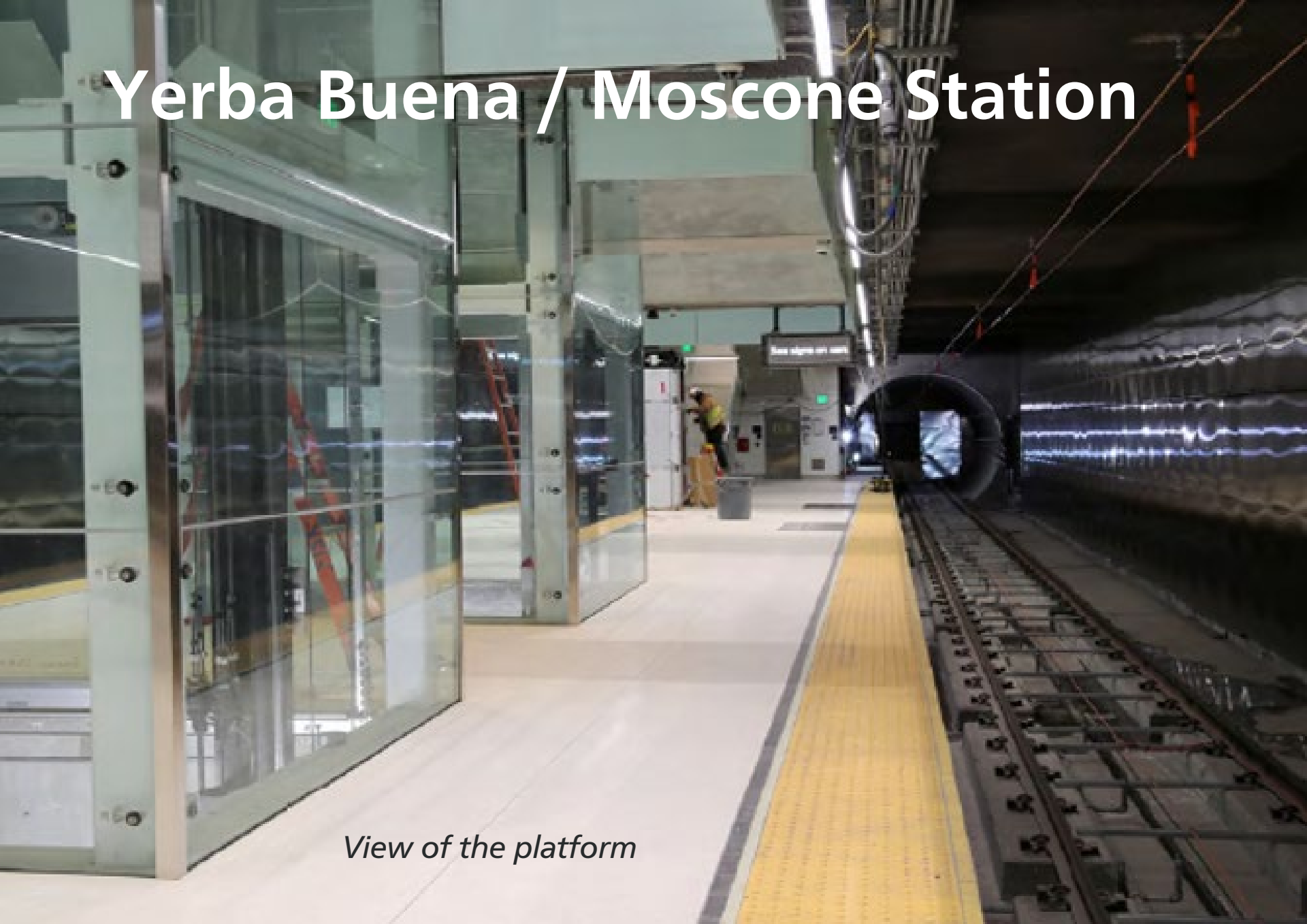
View of the platform