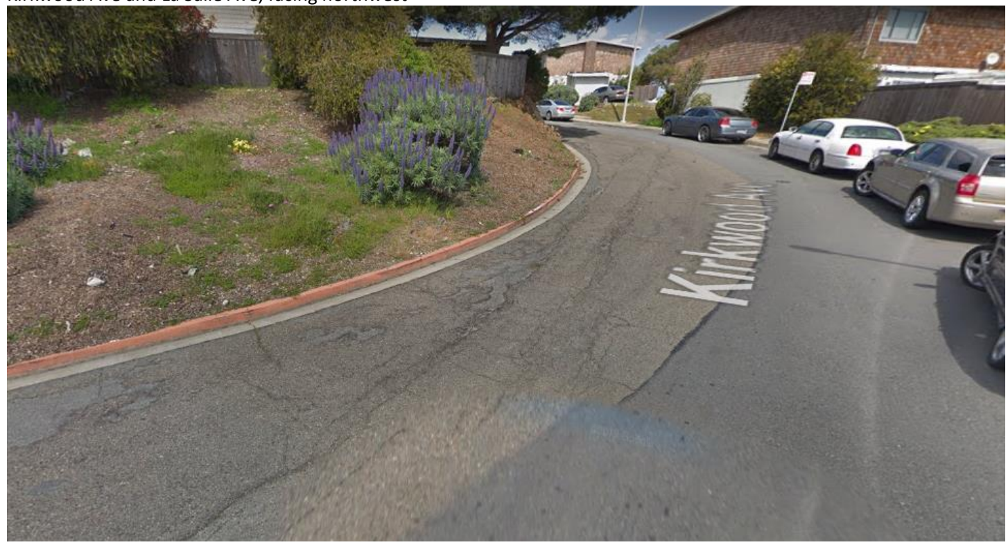
Kirkwood Ave and Nautilus Ct, facing southeast

Kirkwood Ave and La Salle Ave, facing northwest