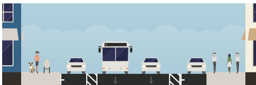
PROPOSED STREET CROSS-SECTIONS ON LEAVENWORTH

Pending project approvals, implementation is anticipated to begin in Spring 2021. For general project information and updates, we invite you to visit SFMTA.com/GoldenGateQB and SFMTA.com/LeavenworthQB or email the project team at TLStreets@SFMTA.com .