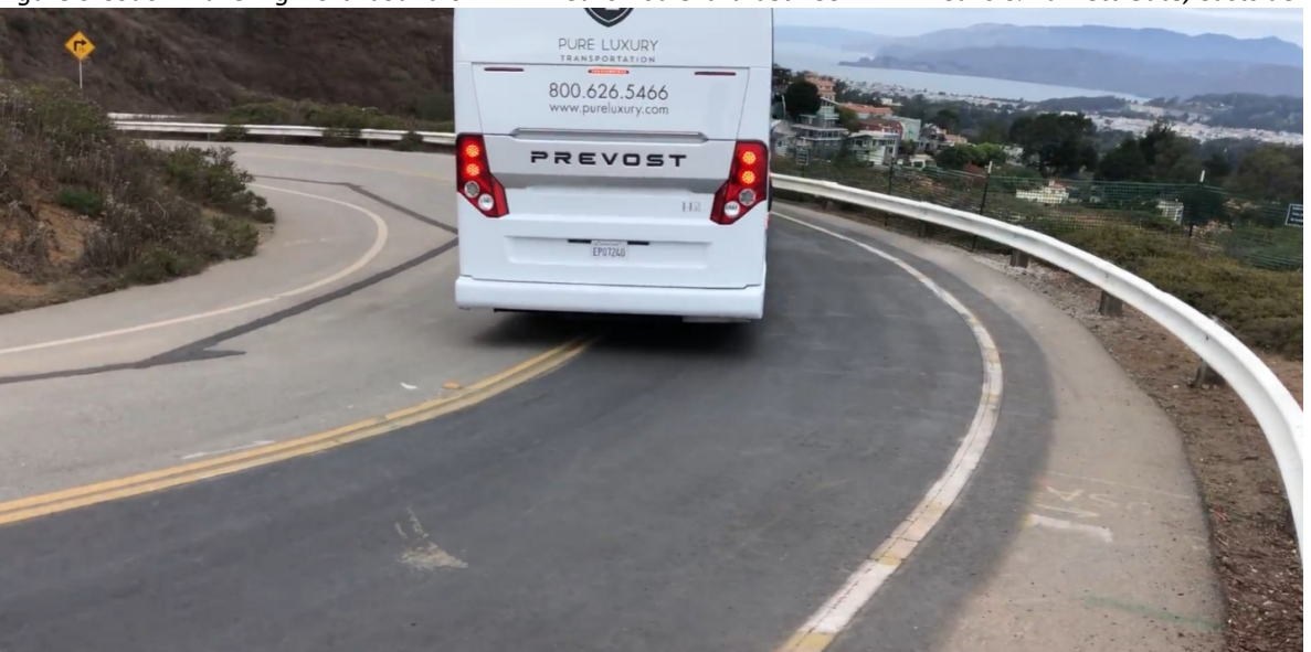
Figure 6 Coach Traveling Northbound on Twin Peaks Boulevard between Twin Peaks & Burnett Gate, westside

Figure 5 Coach Traveling Northbound on Twin Peaks Boulevard between Twin Peaks & Burnett Gate, eastside 2 of 2