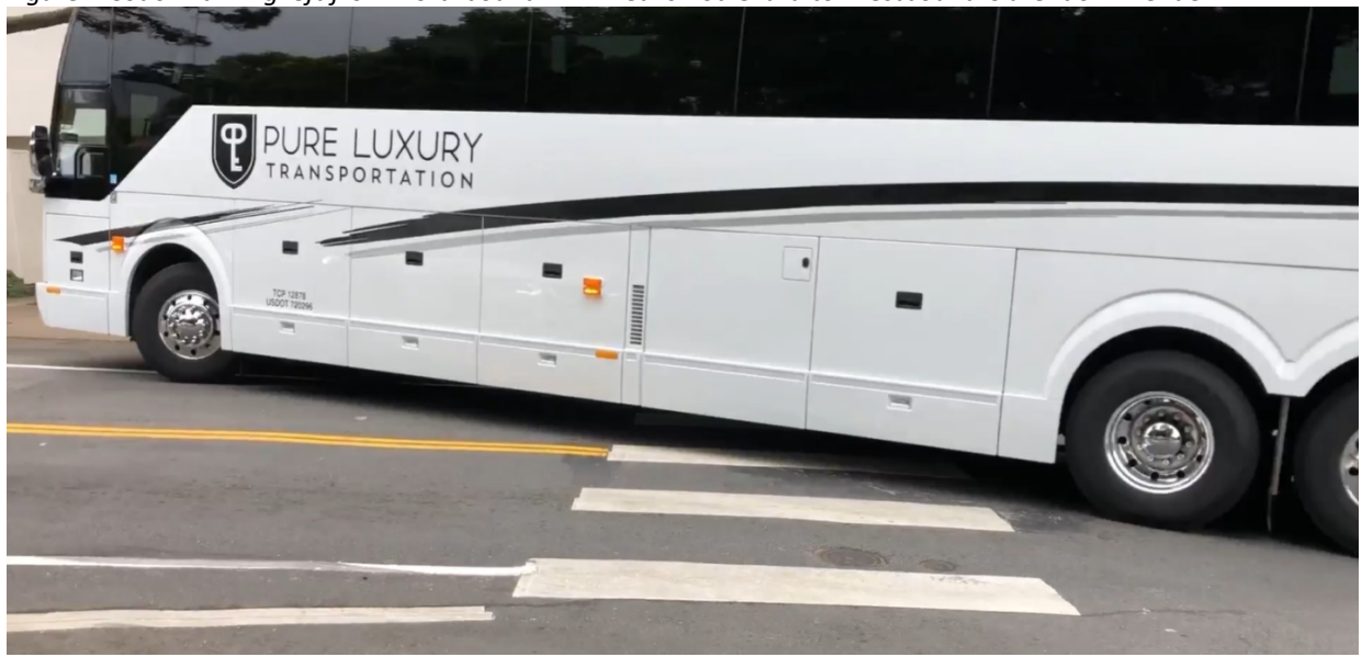
Figure 7 Coach Turning left from Northbound Twin Peaks Boulevard to Westbound Clarendon Avenue

formalize this movement, the SFMTA could consider implementing a red no parking curb to allow for adequate turning space here.