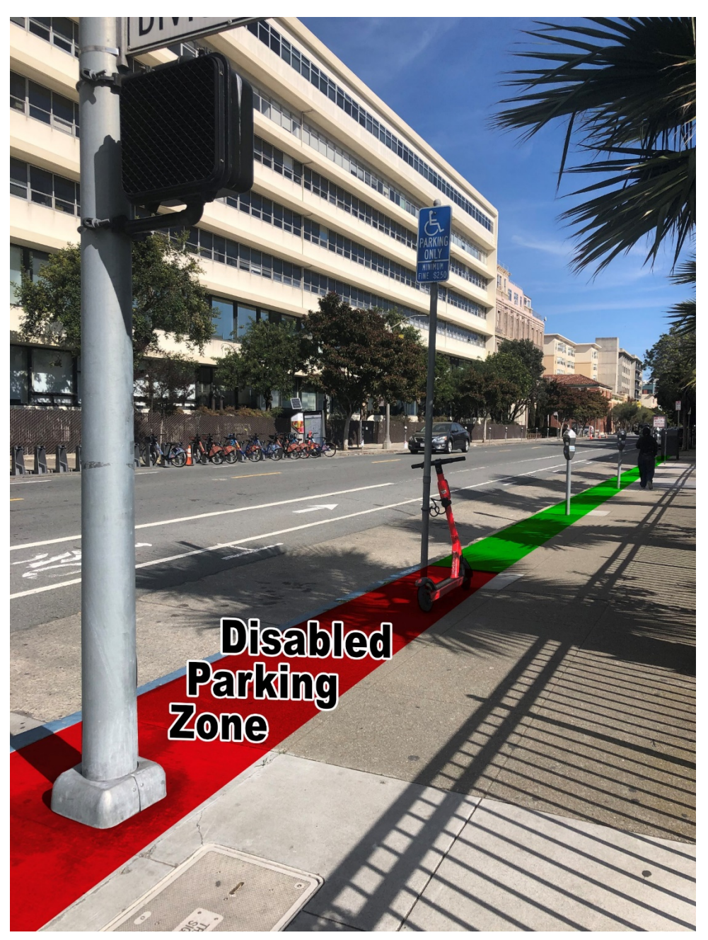
Page 24 of 51