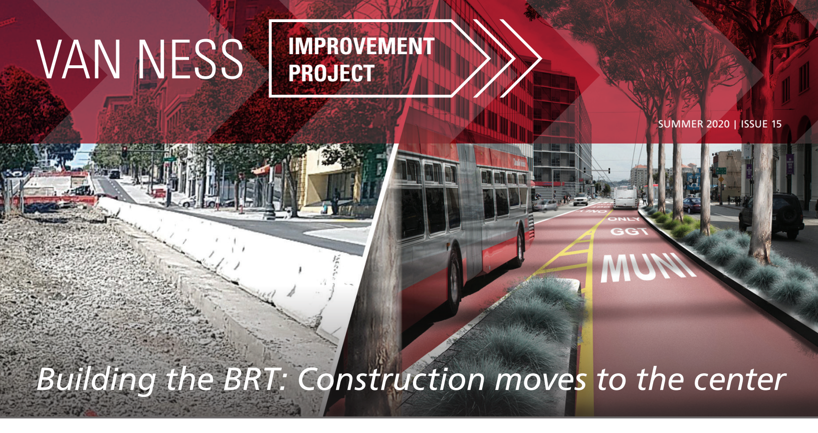
By Nehama Rogozen