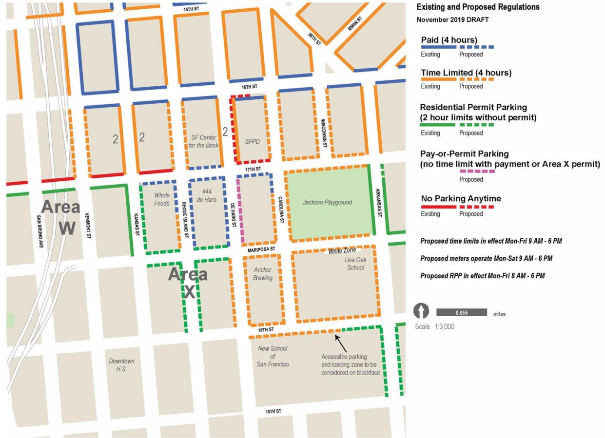
Figure 1: Map of proposed parking modifications in northern Potrero Hill, western area