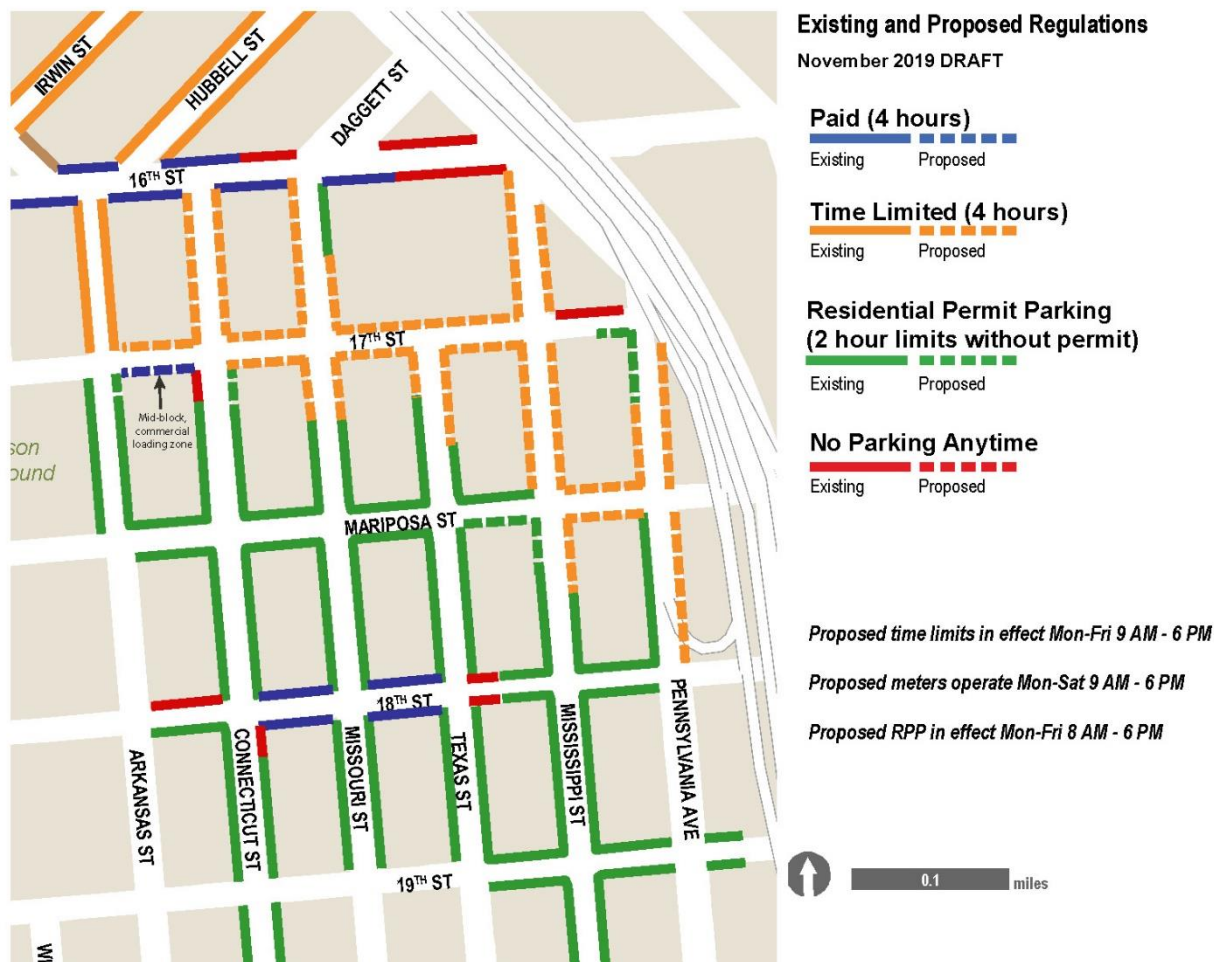
Figure 2: Map of proposed parking modifications in northern Potrero Hill, eastern area

With respect to the proposed parking restrictions near the SFPD’s Special Operations Center, the Transportation Code requires an amendment to reflect the proposed on-street parking restrictions on 16 th , De Haro, and 17 th streets described at Item G.