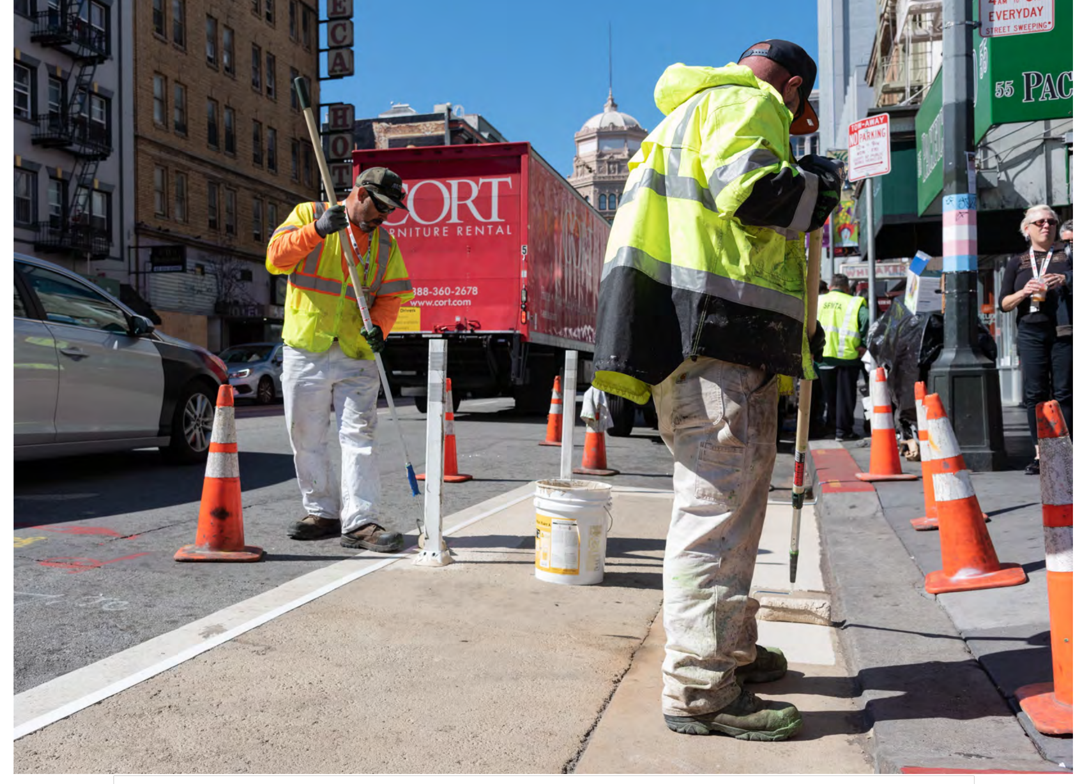
Vision Zero Quick Build Project on 6<sup>th</sup> Street