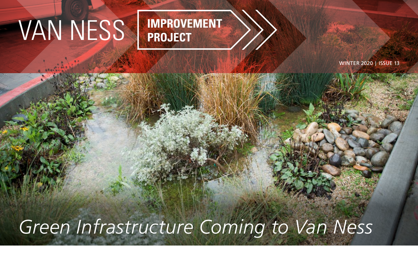
By Estefani Morales-Zanoletti