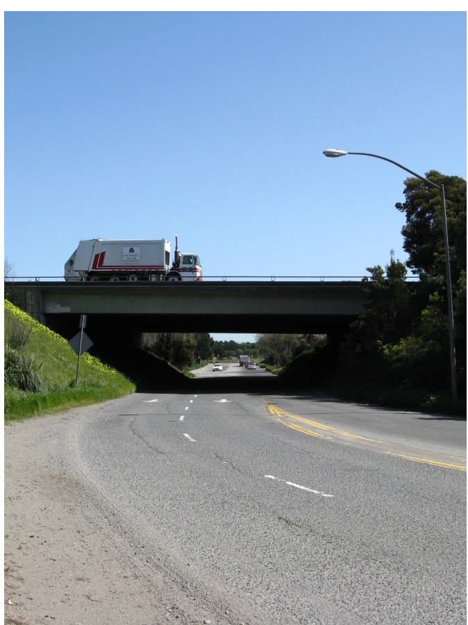
Existing Alana Way