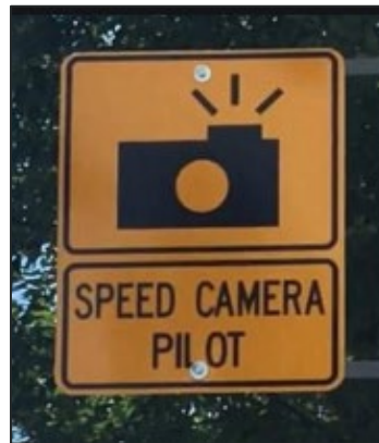
Automated Speed Enforcement