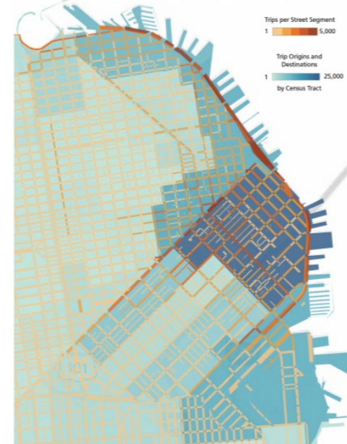
Figure 15 - Origins & Destinations by Census Tract and Trips by Street Segment (Downtown) 25