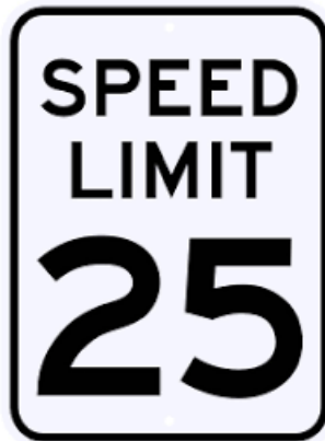
Speed Limit Setting