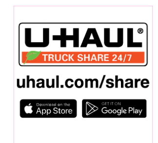
Figure 4: U-Haul Truck Share emblem