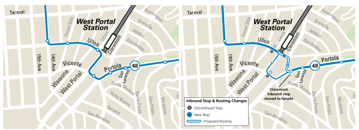
Figure 2: Existing (left) and Proposed (right) Routing and Stop Locations for the 48 Quintara-24<sup>th</sup> Street

In order to accommodate this change, additional routing and stop changes would be required for the inbound/eastbound 48 Quintara-24<sup>th</sup> Street route. As shown in Figure 2, because inbound routing would be removed from West Portal Avenue and Vicente Street, the inbound bus stop on Vicente Street would be removed and the inbound bus stop on Portola Drive at Claremont Street would be relocated slightly further east. These changes will streamline the routing of the 48 Quintara-24<sup>th</sup> Street by providing a more direct route, which will improve travel times for passengers.