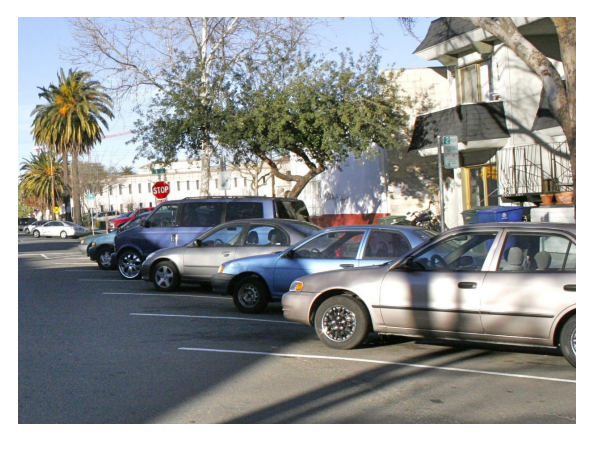
Back-in Angled Parking (Kirkham to Lawton streets)

Red pedestrian visibility zones in advance of each crosswalk