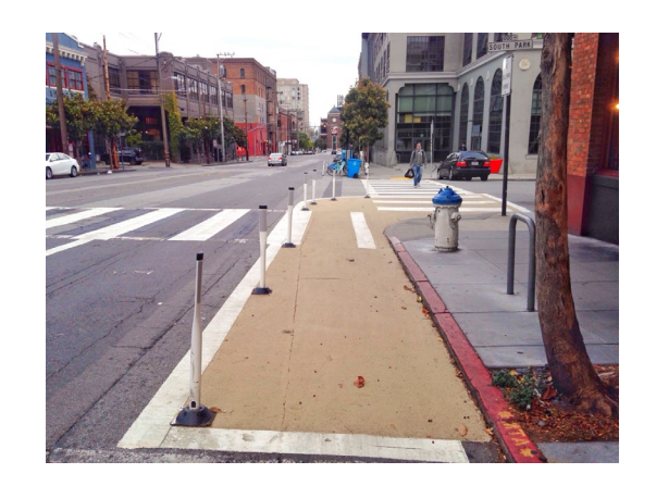
Painted Safety Zones (PSZ)