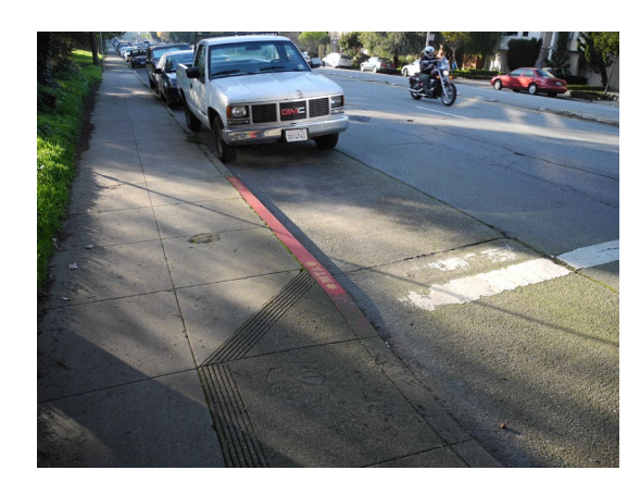
Pedestrian Visibility Zones (Daylighting)