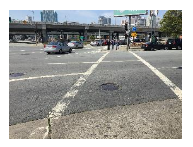
There are long pedestrian crossings at the highway on/off ramps at Bryant and Harrison Streets