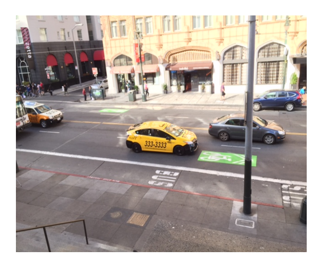
5<sup>th</sup> Street currently includes only sharrows both north and southbound from Market to Townsend.

In the most recent five-year collision history available (January 2011 through June 2016), there were 328 total collisions and 296 injuries reported on 5th Street between Market and Townsend.