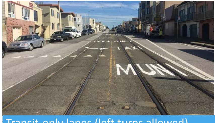
Transit-only lanes (left turns allowed)