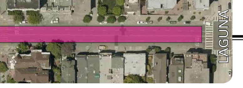
Conceptual Design Option - Van Ness Ave to Polk Street

*No lane reduction proposed on this segment