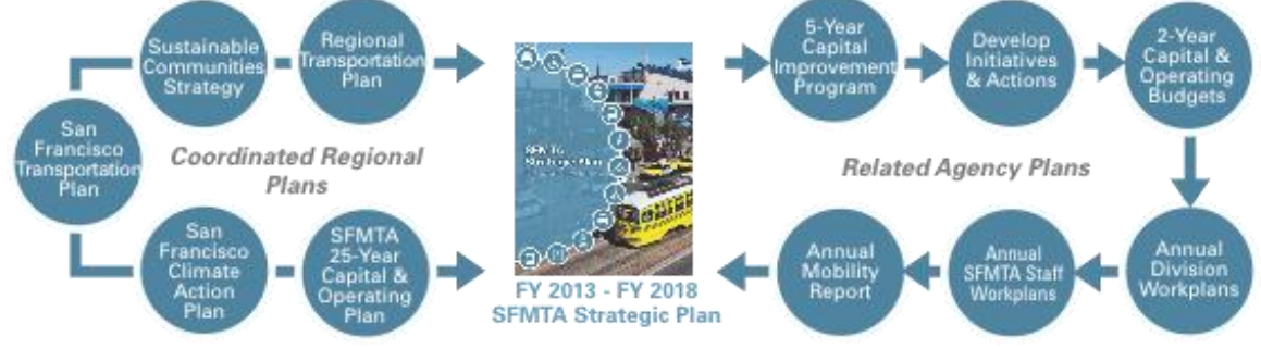
Figure 1: Relationship between the FY 2013- FY 2018 SFMTA Strategic Plan with other regional and SFMTA plans

In addition to the regional plans, the San Francisco County Transportation Authority (SFCTA) is the designated congestion management agency for the city and, in coordination with the SFMTA, develops the 25-year long-range transportation plan for the city and county. The SFMTA and SFCTA are collaborating on the development of the San Francisco Transportation Plan, drawing heavily from regional planning efforts, demographic projections and local long-term land use development plans. Lastly, the Agency develops internal multimodal and modal mid- and long-range plans for transportation capital and operational needs. The Capital Plan provides an unconstrained prioritization of capital needs and filters projects based on performance criteria. The five-year Capital Improvement Program includes those multimodal capital needs that can be delivered in that funding timeframe.