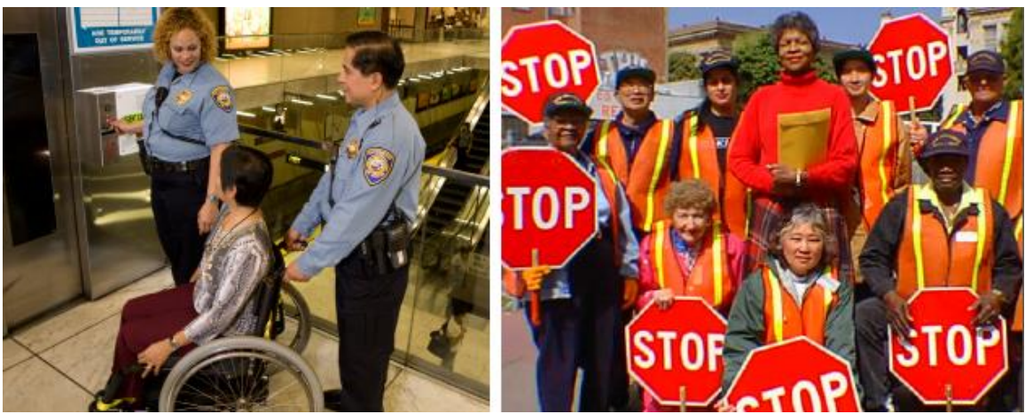
Left image: group using the elevators to access the Muni subway platforms Right image: a group of crossing guards with signs