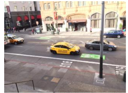
5 th Street currently includes only sharrows both north and southbound from Market to Townsend.