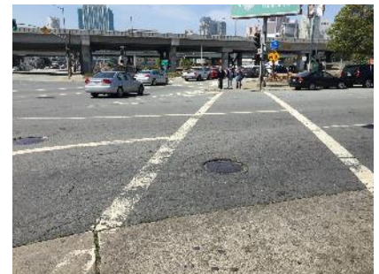
There are long pedestrian crossings at the highway on/off ramps at Bryant and Harrison Streets.