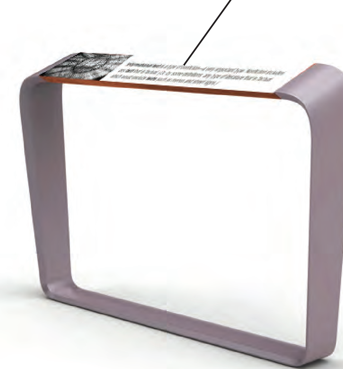
CABLE CAR INTERPRETIVE FEATURE