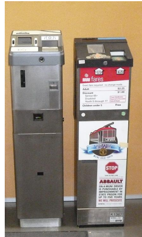
New Farebox (left) Existing Farebox (right)