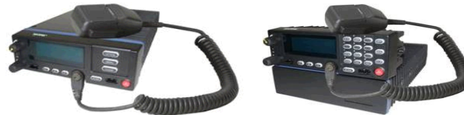
New Radio Units