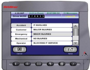
New Vehicle Data Terminal