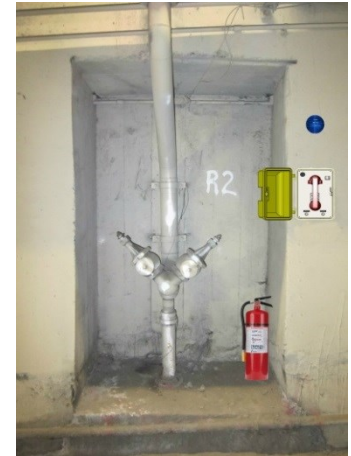
Existing ET Phone Cabinet