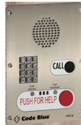
New Blue Light ET Phone