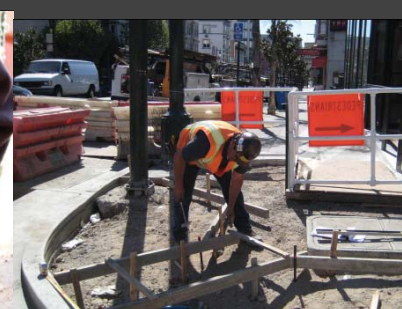
OCEAN AVENUE CORRIDOR DESIGN PROJECT