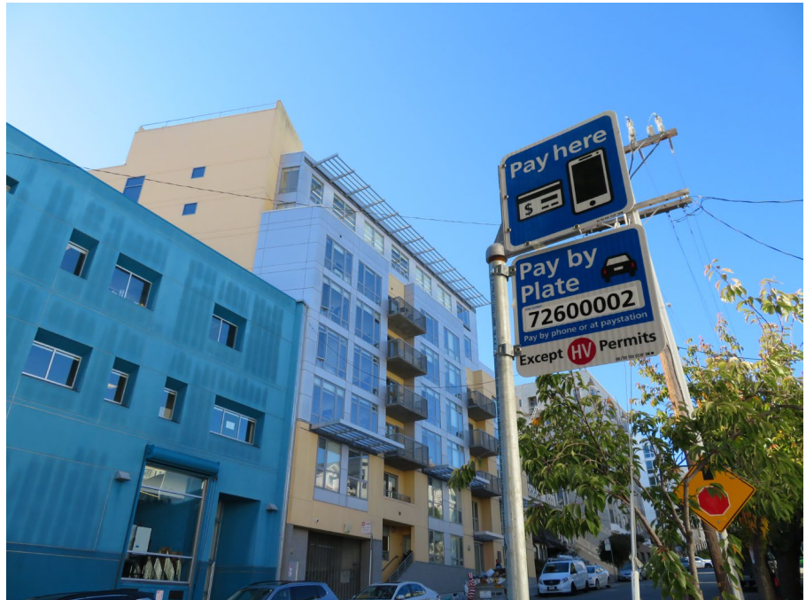
A sign for Pay or Permit Parking in Hayes Valley

The two-hour time limit that governs most RPP spaces generally discourages all-day parking by non-residents. However, its enforcement is much more difficult than enforcement of metered parking, as it requires two passes (one to mark the car, and another more than two hours later to actually issue the citation) as opposed to one for metered parking. This challenge for enforcement means more drivers may exceed the time limit without facing a citation. The time limit also makes things more difficult for visitors who may have a legitimate reason to stay longer while still following the rules, as it requires them to move their car every two hours – a cumbersome task for, for example, a plumber working on a major installation project.