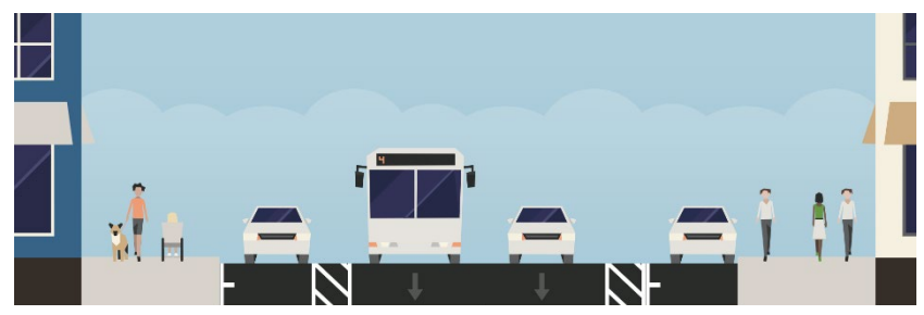
PROPOSED STREET CROSS-SECTIONS ON LEAVENWORTH