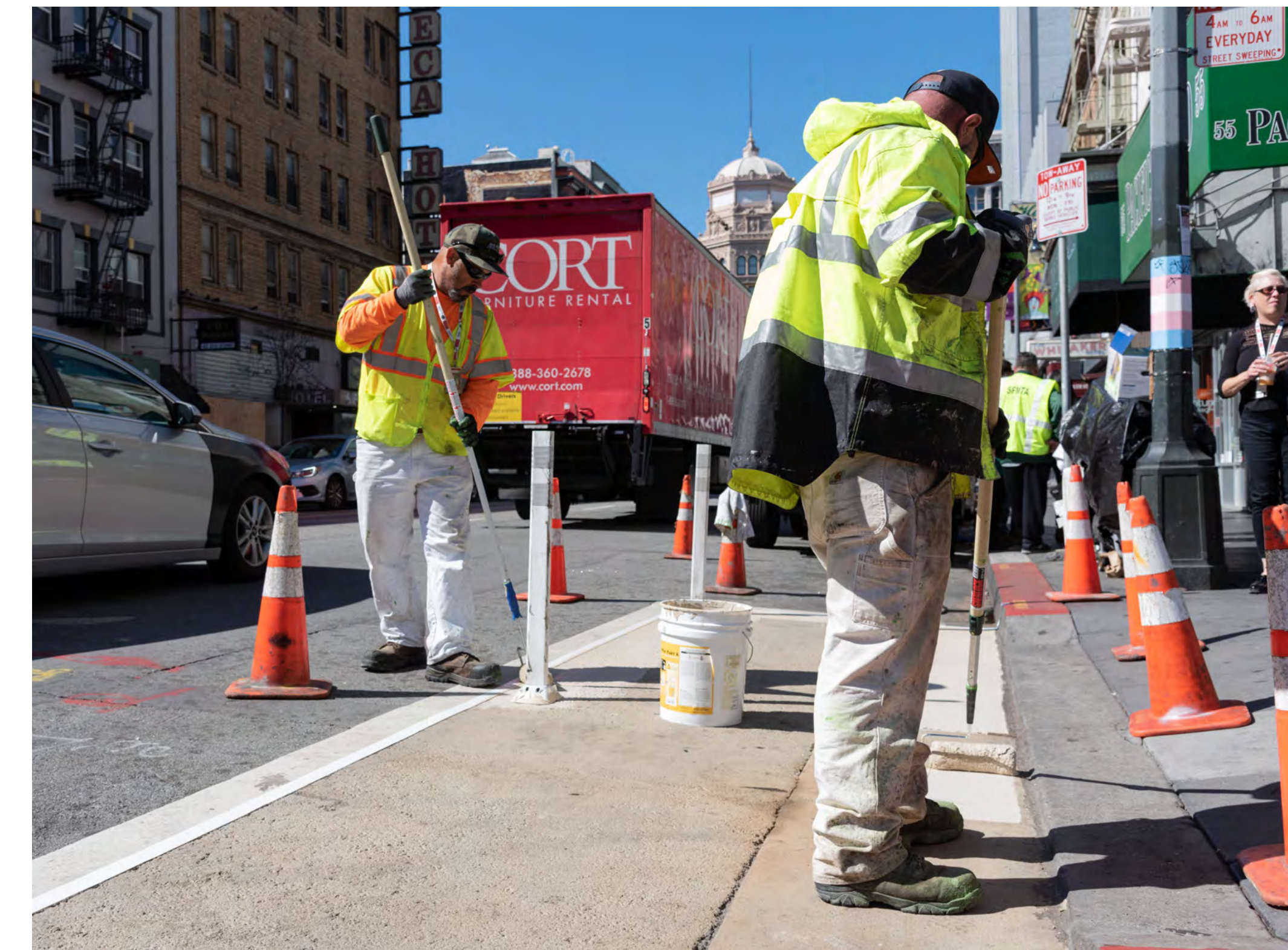
Vision Zero Quick Build Project on 6 th Street