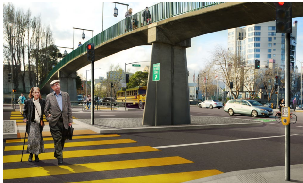
Photo-simulation of the future surface crossing at Webster

The Geary Rapid Project aims to improve one of San Francisco's busiest corridors with much needed safety improvements and more reliable bus service for the 38 Geary and 38R Geary Rapid's 56,000 daily customers. Prior to the project's final approval in August 2018, the Geary Rapid Project team consulted with seniors and people with disabilities regarding the project's accessibility features, including meetings with the Mayor's Office of Disability, the SFMTA Multimodal Accessibility Advisory Committee, Senior Disability Action, as well as presentations at several senior centers (SF Senior Center, Russian American Community Services, and Richmond Senior Center). Implementation of the project began in October 2018 and will continue through spring 2021.