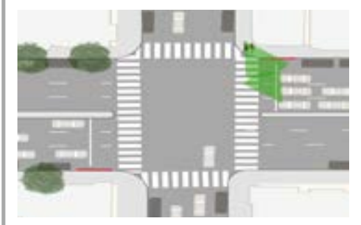
Daylighting limits curbside parking and improves visibility.