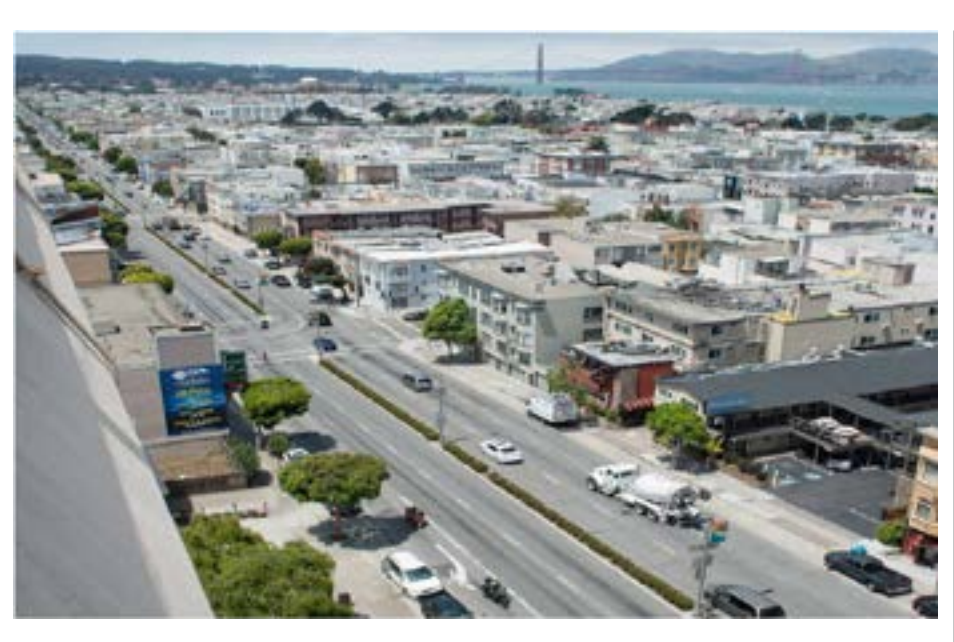
Lombard Street is a gateway to San Francisco but is also a high-injury corridor.

27 pedestrian collision injuries per mile, compared to 4 citywide.