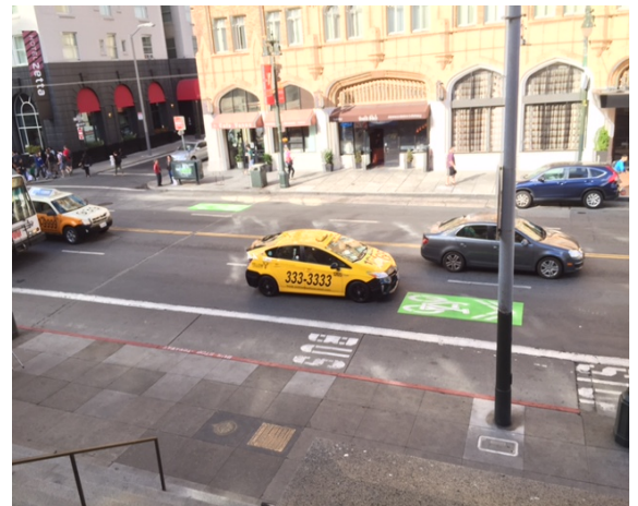
5 th Street currently includes only sharrows both north and southbound from Market to Townsend.

In the most recent five-year collision history available (January 2011 through June 2016), there were 328 total collisions and 296 injuries reported on 5 th Street between Market and Townsend.