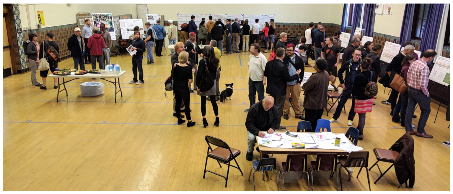
Open House #3