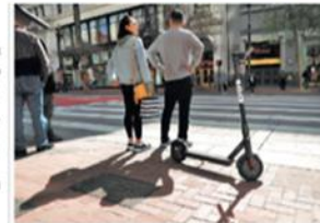
A Bird scooter is left on Market Street for the next user to pick up with the rental app. The scooters have no docks and can be left anywhere.

Detractors complain that others are leaving the scooters — sometimes, piling them — in the middle of sidewalks and bike lanes, and blocking