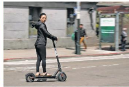
A rider cruises down Mission Street on a Bird scooter. Almost an city regulations govern the vehicles — yet.