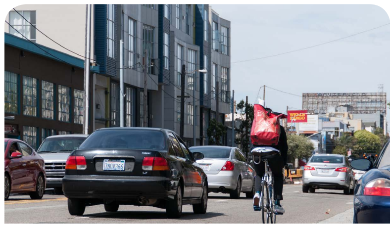
Existing street conditions are challenging for road users.

Brannan Street is a major east-west corridor in the South of Market (SoMa) neighborhood. Like many other streets in SoMa, the rapid growth has not kept pace with various transportation needs of those who live, work and commute in the neighborhood. The Brannan Street Safety Project will improve safety along the corridor to better accommodate all modes of travel between Division Street and The Embarcadero. Safety improvements include reducing the number of travel lanes (four to three lanes), installing bike lanes, pedestrian enhancements and improving intersection safety (please see reverse for details).