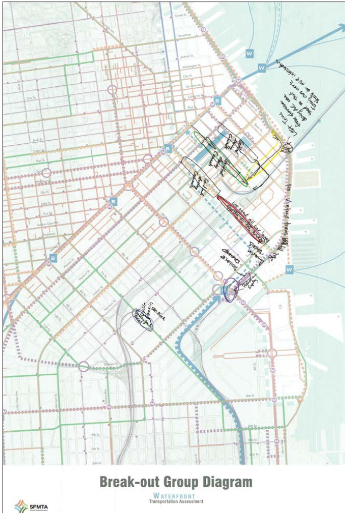
Break-out Group Diagram