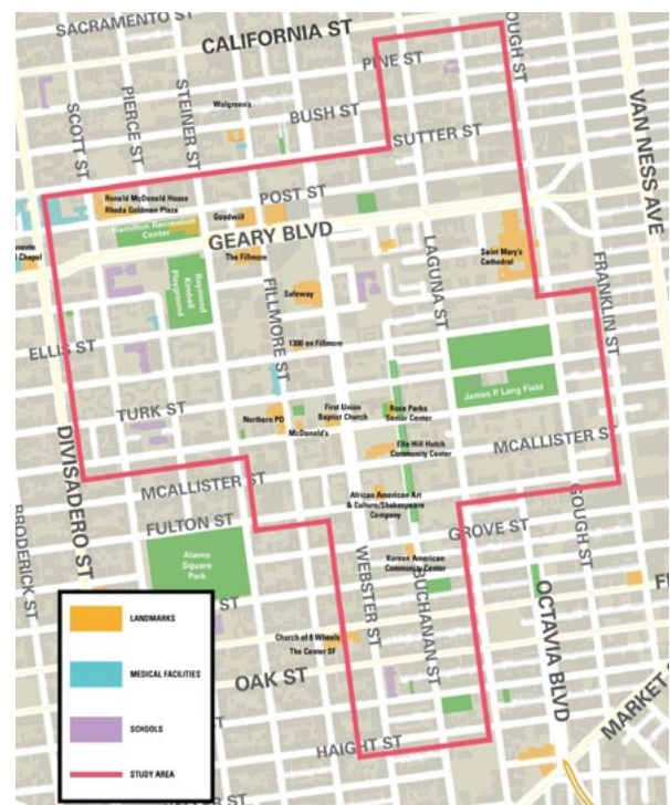
Above: Outreach activities and Project Area for the Western Addition Community-Based Transportation Plan

311 Free language assistance / 免費語言協助 / Ayuda gratis con el idioma / Бесплатная помощь переводчиков / Trợ giúp Thông dịch Miễn phí / Assistance linguistique gratuite / 無料の言語支援 / 무료 언어 지원 / Libreng tulong para sa wikang Tagalog / การช่วยเหลือทาง ด้านภาษาโดยไม่เสียค่าใช้จ่าย / خط المساعدة المجاني على الرقم