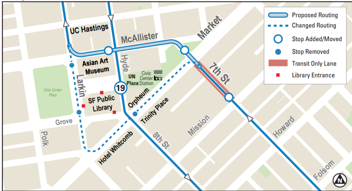
Revised: 10/24/2016 Figure 2: Image of proposed Muni 19 Polk reroute from Market Street onto McAllister Street

The proposed reroute requires removal of the 19 Polk stops at Market and Hyde (Orpheum Theatre stop), at Larkin Street and Grove Street (San Francisco Public Library (SFPL) Main Branch stop) and at Larkin Street and McAllister Street (Asian Art Museum stop) to the existing bus stops at Charles J. Brenham Place and Market Street (UN Plaza stop) and McAllister Street and Hyde Street (UC Hastings stop). Boardings and alightings at these stops are as follows: