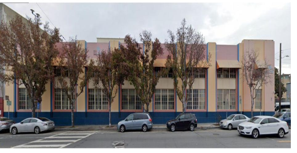
Building Elevation Facing Harrison St.