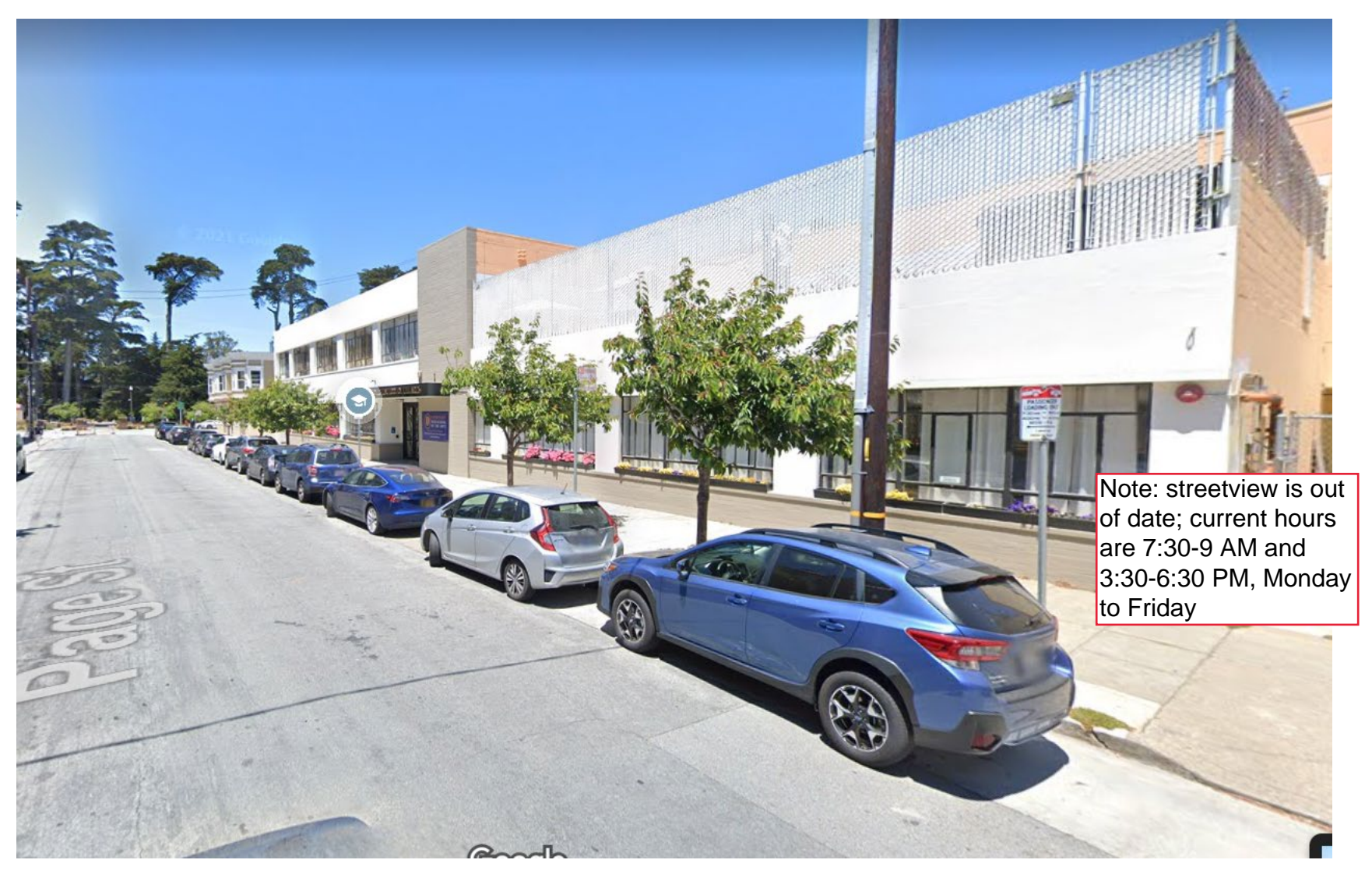
SF High School of the Arts, 1950 Page Street