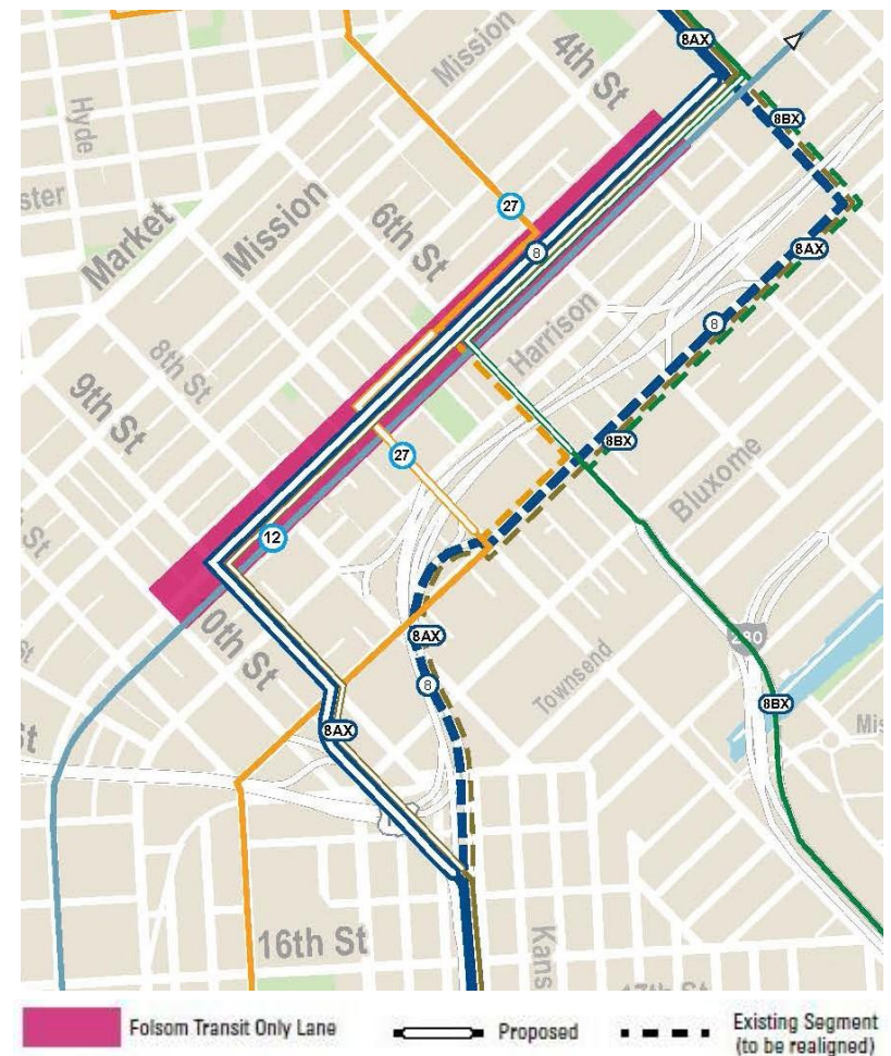
Future Folsom Transit Service Map