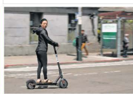
A rider cruises down Mission Street on a Bird scooter. Almost an city regulations govern the vehicles — yet.