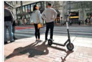
A Bird scooter is left on Market Street for the next user to pick up with the rental app. The scooters have no locks and can be left anywhere.