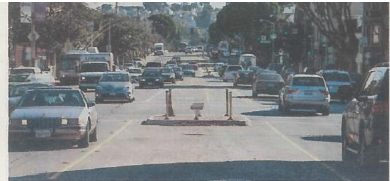
Citizen Concerns Prompt Changes to Potrero Avenue Streetscape Project