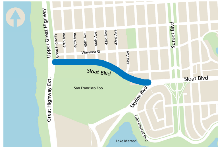
Project limits: Great Highway and Skyline Boulevard