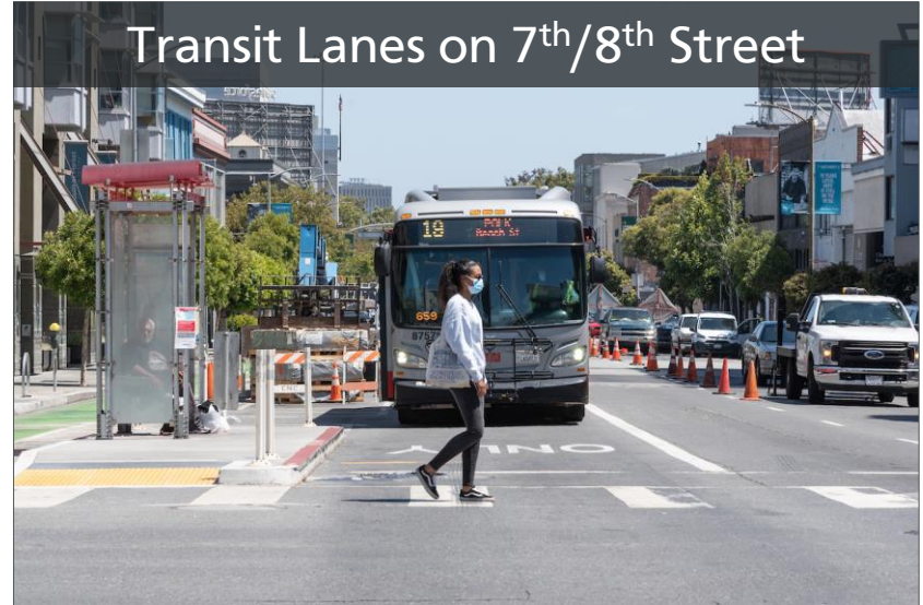
Transit Lanes on 7 th /8 th Street