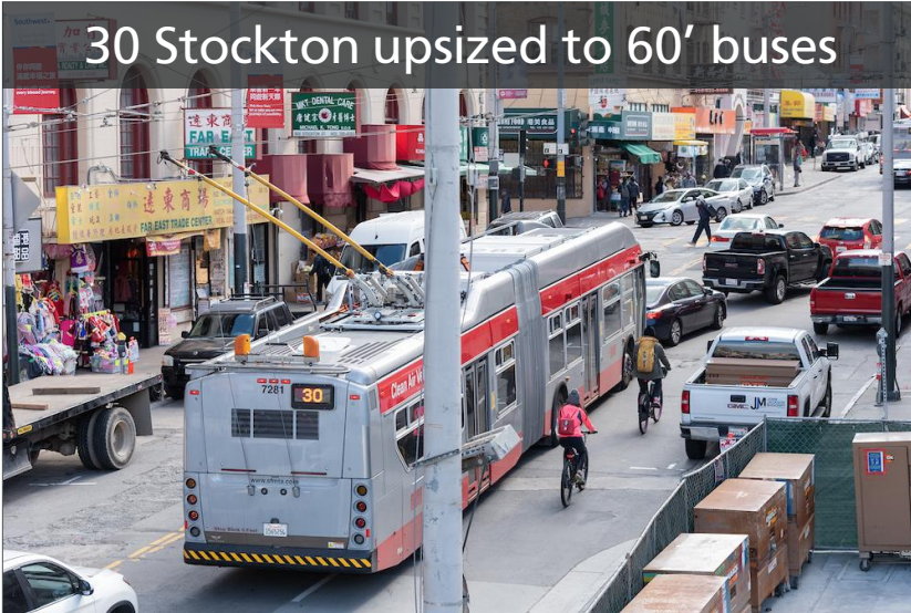
30 Stockton upsized to 60' buses