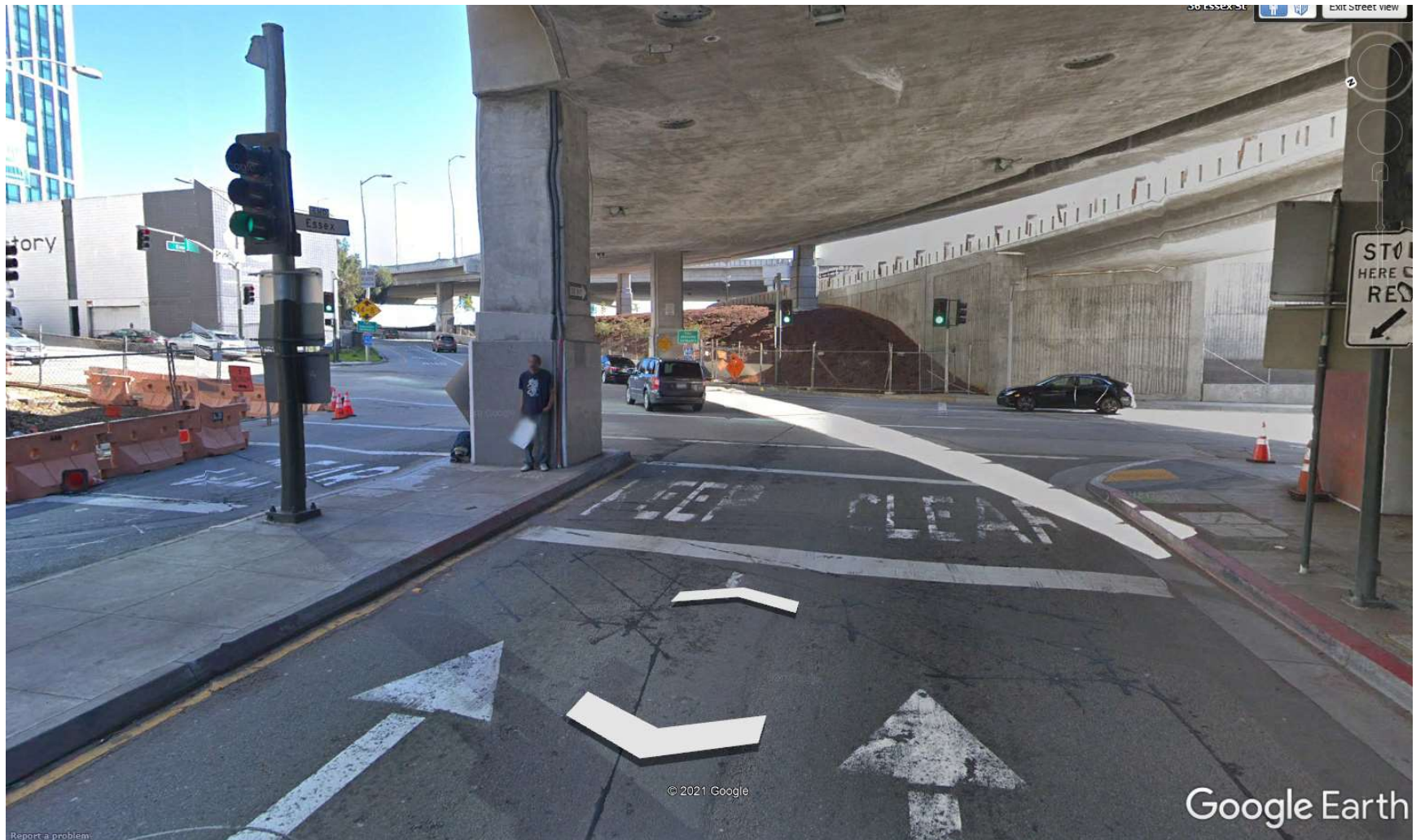
Essex Street, looking southbound towards Harrison Street intersection. Muni buses make a right turn movement from the left side of the median island during a protected bus-only signal phase.