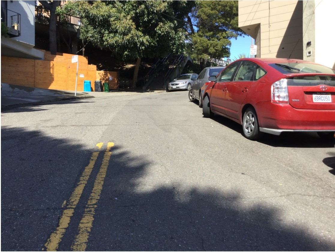
WB Short Street, approaching 10 Short Street (silver car parked in front of driveway) ALAM 7/17/2020