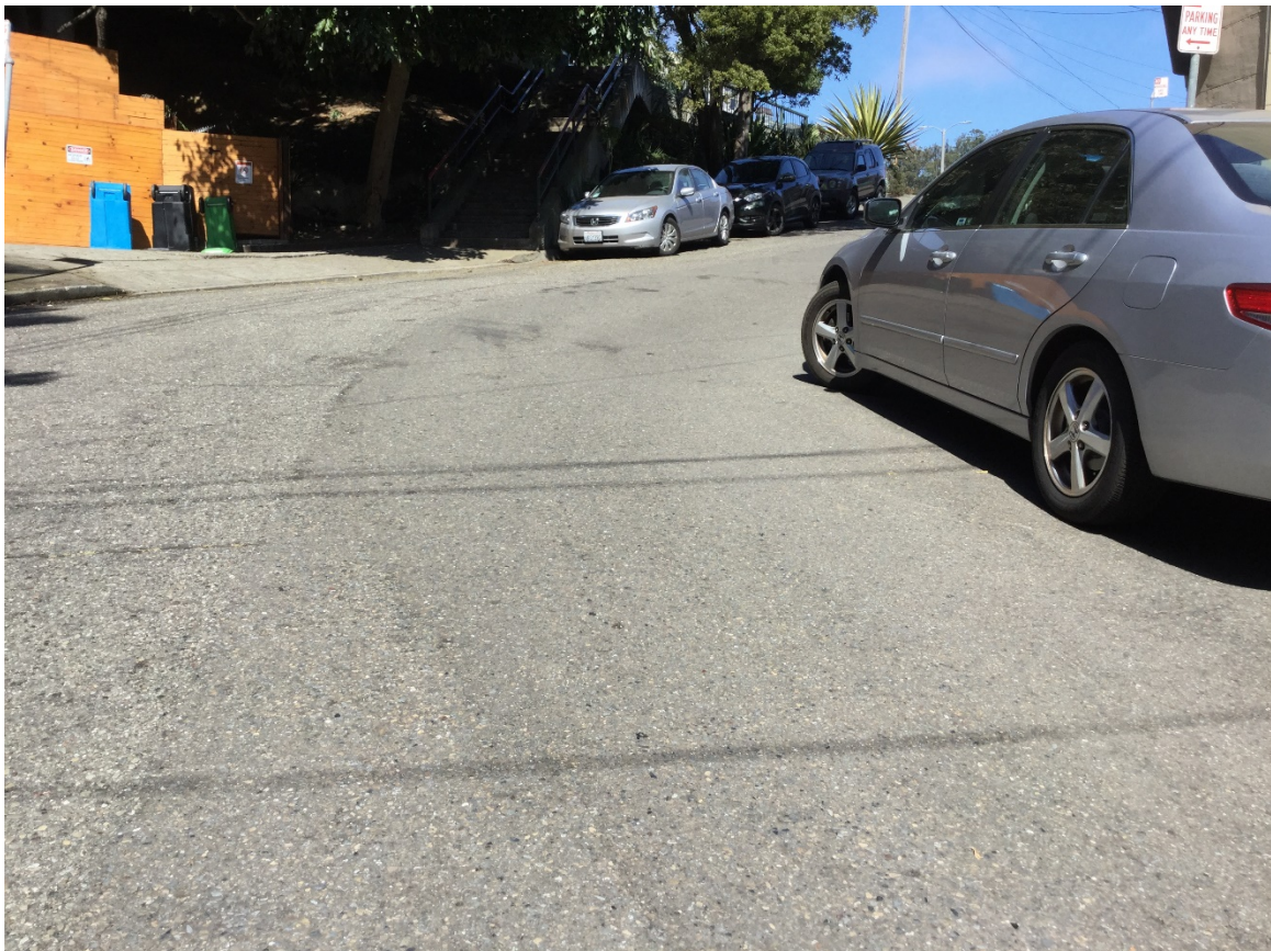
WB Short Street, in front of 10 Short Street