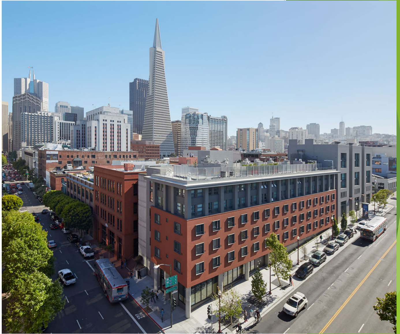
Broadway Sansome Family Housing