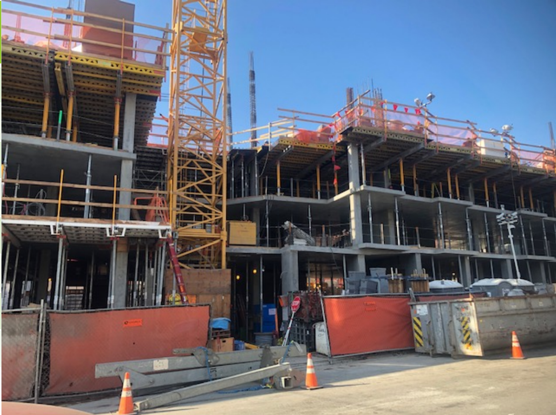
1296 Shotwell Under Construction

Total MOHCD expenditures for above pipeline: $260MM